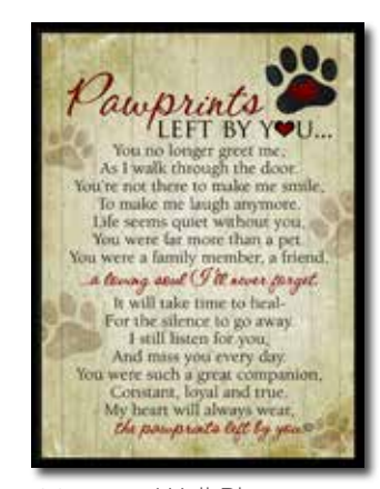
6071 5x7 Wall Plaque

11x14 black wall collage frame with "Pawprints" poem and spaces for 6 pet photos. Engravable plaque included. Made in USA.