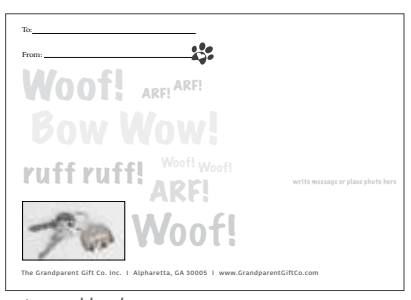
note card back