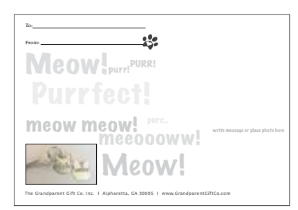
note card back