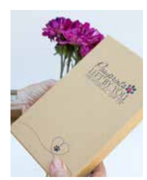
Ready-to-Give Box 8.5x 5.25